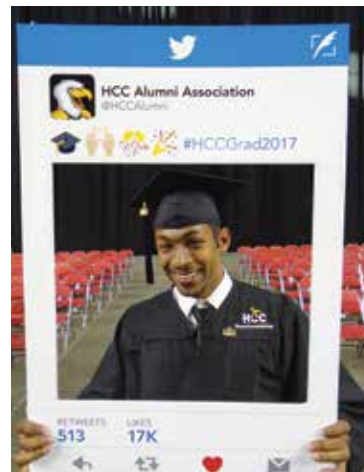
Top: Alumni Adopt-a-Family; Bottom: Future HCC Alumni show their Eagle Pride in Twitter photos at graduation