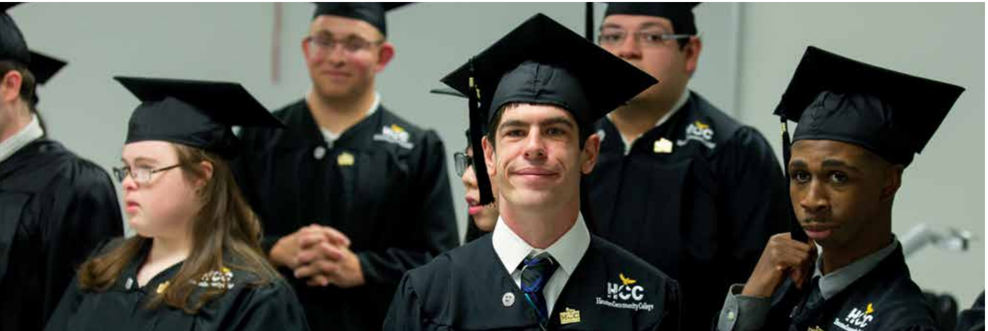
VAST Academy graduation